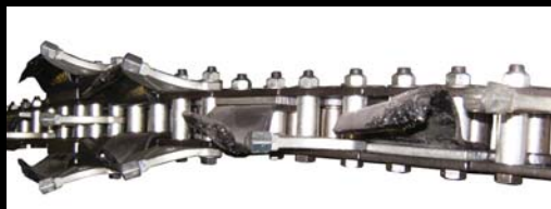
70/30 SCORPION CHAIN