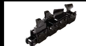
50/50 SHARK TOOTH CHAIN